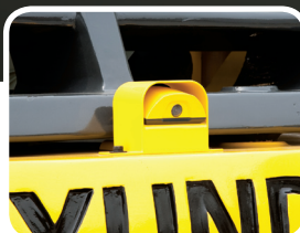
Rear View Camera (Option)