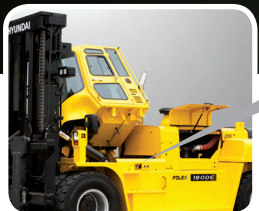
Cabin Tilting Automatic System