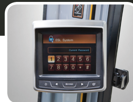
ESL(Engine Start Limit) (Option)